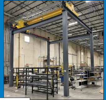
(20+) Free-Standing Crane Systems by Gorbel and Cranerwerks Up to 5 Ton