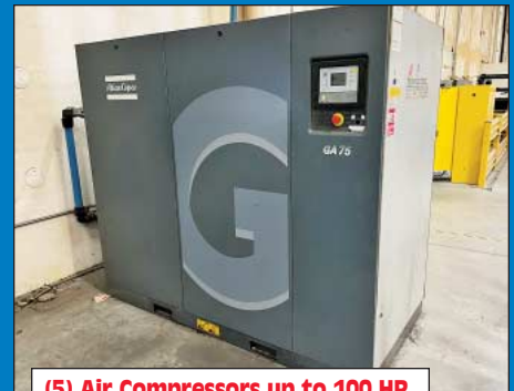
(5) Air Compressors up to 100 HP