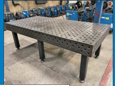
(70+) Miller Welders (New as 2016) & Large Quantity HD Tables, Clamps & Accessories

(30) Various Size Heavy Duty Steel Welding Tables (20) Portable Hydraulic Scissor Lift Tables Huge Quantity of C-Clamps, Bar Clamps, Vise Grip Clamps, Air Grinders, Welding Supplies, and Related Items (50) Various Size Welding Curtains 500 Lb. Preston Easton Model PA-5MT Welding Positioner; s/n PA5-287 Large Quantity New Welding Wire