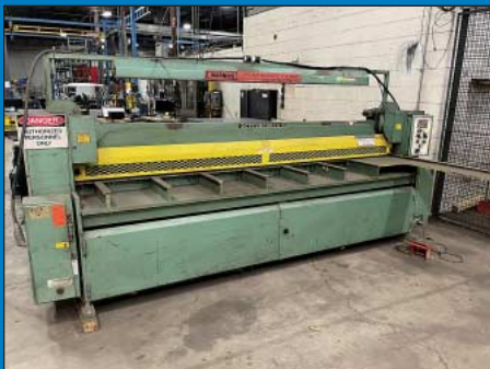
10' x 3/16" Betenbender Hydraulic Shear

Visit www.cia-auction.com for more photos & videos!