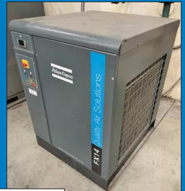
(5+) Air Compressors & Dryers by Atlas Copco, Quincy and Others (New as 2012)