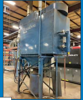
(4) Paint / Cure Booths, Paint Accessories and Torit Dust Collectors