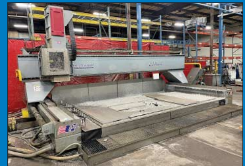
Northwood Machine MC-158 3-Axis Gantry Style CNC VMC **Subject to Withdraw**