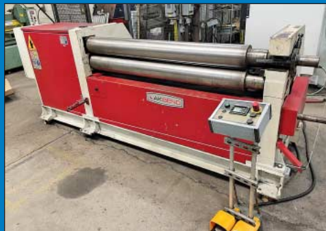
5' x 5/16" AKBEND ASM-S 170-15/7.0J Plate Bending Roll