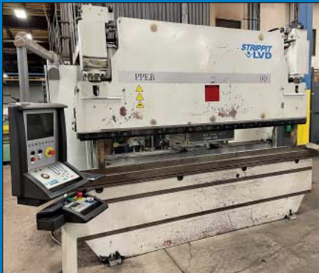
90 Ton x 10' Strippit/LVD 90 BH 10 5-Axis CNC Press Brake