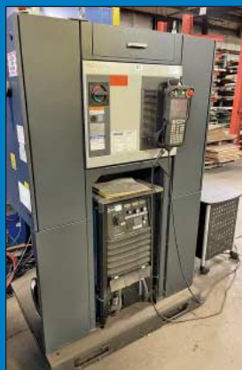
Miller Auto Continuum 350 Power Supply