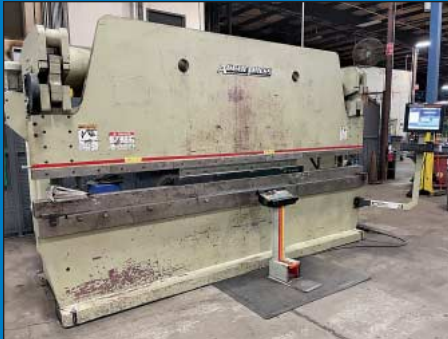
250 Ton x 14' Accurpress 725014 2-Axis CNC Press Brake