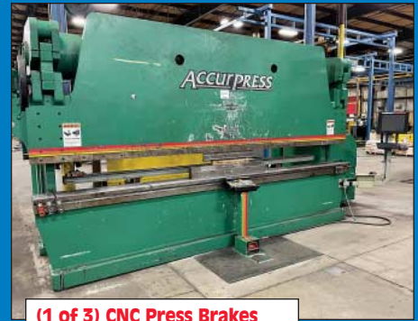
(1 of 3) CNC Press Brakes