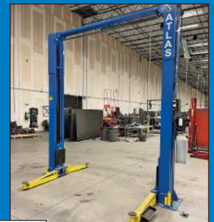
HD Steel and Aluminum Plate, (100+) Sections of Pallet Rack and (5) Atlas Car Lifts