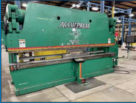
400 Ton x 16' Accurpress 740016 3-Axis CNC Press Brake