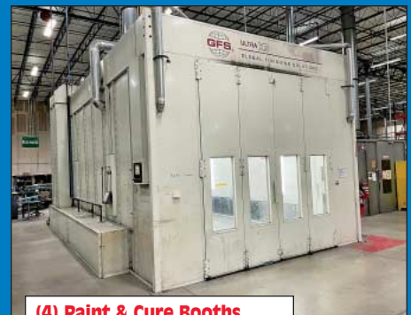
(4) Paint & Cure Booths